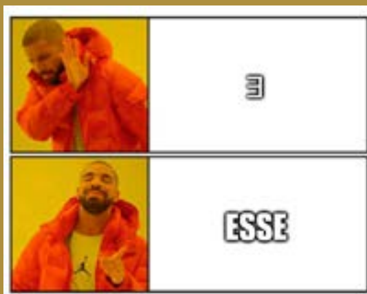
meme by Dominic LaMantia